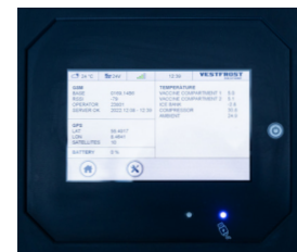
GPS coordinates & GSM connectivity