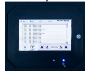
Remote alarm logs