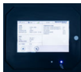
// GPS coordinates & GSM connectivity