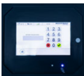
// Password access