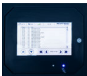
// Remote alarm logs