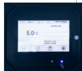
// 5" touch display