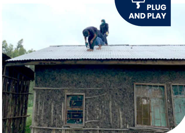
// Installation of solar panels in Ethiopia