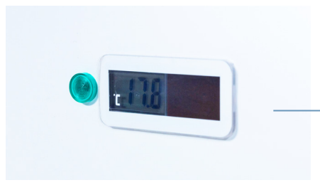
// // Solar powered front display