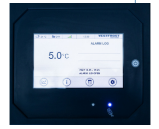
// 5" touch display